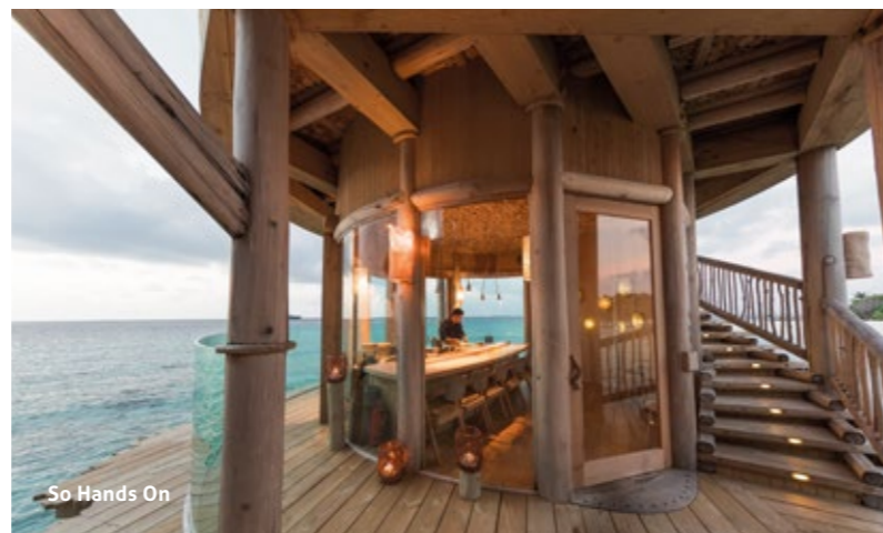
So Hands On