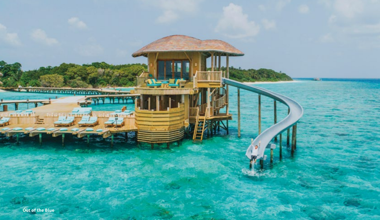
Out of the Blue