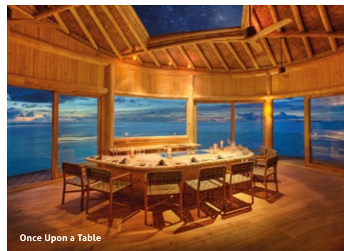
Once Upon a Table

A culinary theatre showcasing a no menu concept only for visiting chefs. 8 seats only.