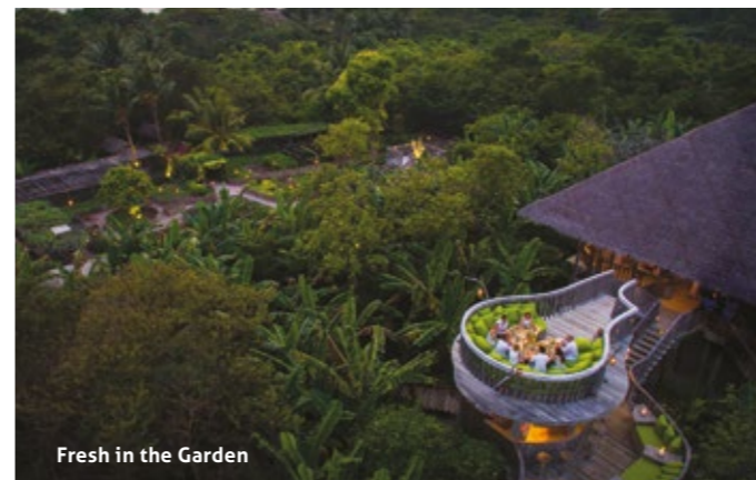
Fresh in the Garden

Flames and smoke set the stage for So Bespoke, Out of the Blue's open-air Teppanyaki table.