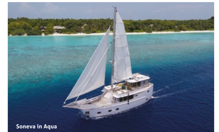
Soneva in Aqua

A luxurious floating villa that sets sail from Soneva Fushi, Soneva in Aqua affords guests the luxury of three charter routes that sail around and beyond the Baa Atoll. Guests can choose between one, two and three-night excursions depending on how much of the awe-inspiring sights of the Indian Ocean they wish to explore.