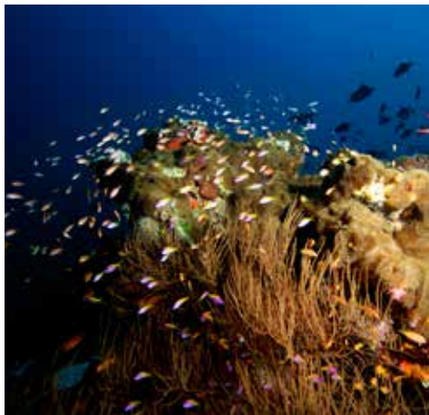
ACTIVE MARINE LIFE