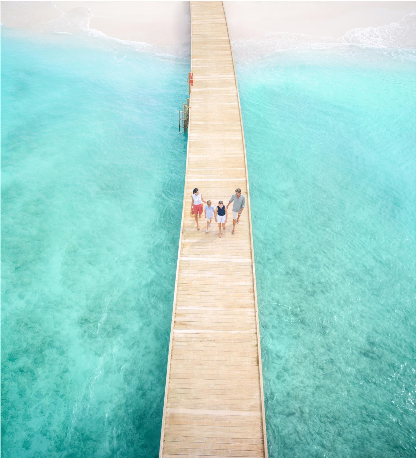
InterContinental Maldives Maamunagau Resort Raa Atoll, Republic of Maldives