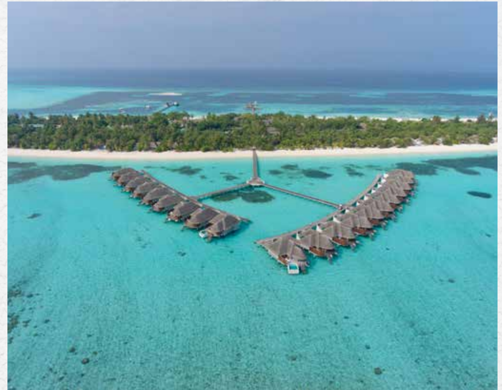
Kanuhura Maldives Lhaviyani Atoll, Republic of Maldives