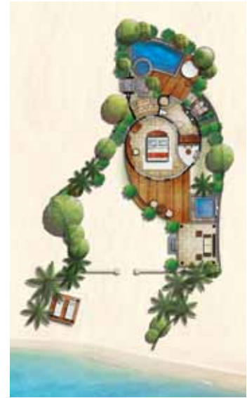
Estimated Floor Area 120sqm All plans are not drawn to scale