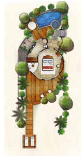
Estimated Floor Area 110sqm All plans are not drawn to scale