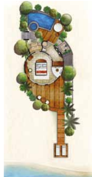
Estimated Floor Area 110sqm All plans are not drawn to scale

The Beachfront Pool Villa delivers unparalleled privacy in a walled garden, which comprises a sundeck, pool, jet pool, outdoor and indoor shower and a recessed sitting area perfect for a lazy afternoon lounging on the sundeck.